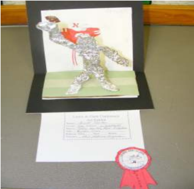
Arnold Harlan 5 th Grade Tin foil man & drawing 2 nd place