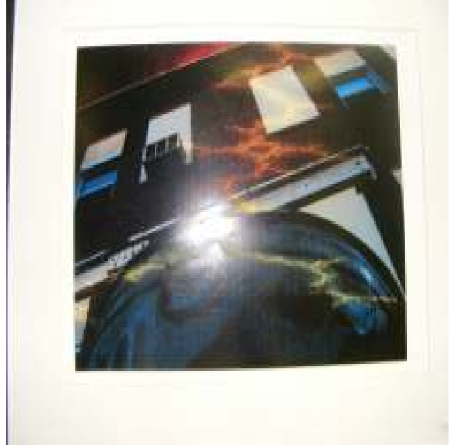
Tom Ball 12 th Grade Computer Altered Photo 2 nd Place