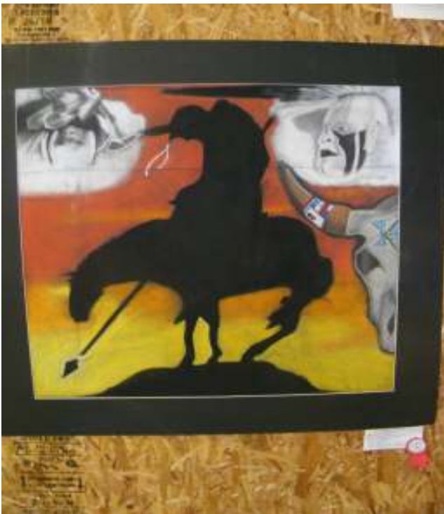
Sinjin Sheridan 12 th Grade Chalk Drawing 2 nd Place