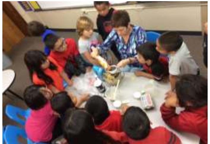
Mixing up ingredients for cookies