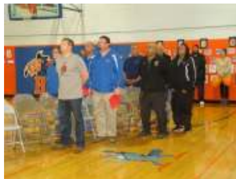
Honored Vets in attendance