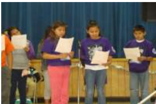
5 th Grade Readers Tribute