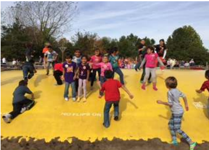
Jumping Pillow at Vala's Pumpkin Patch