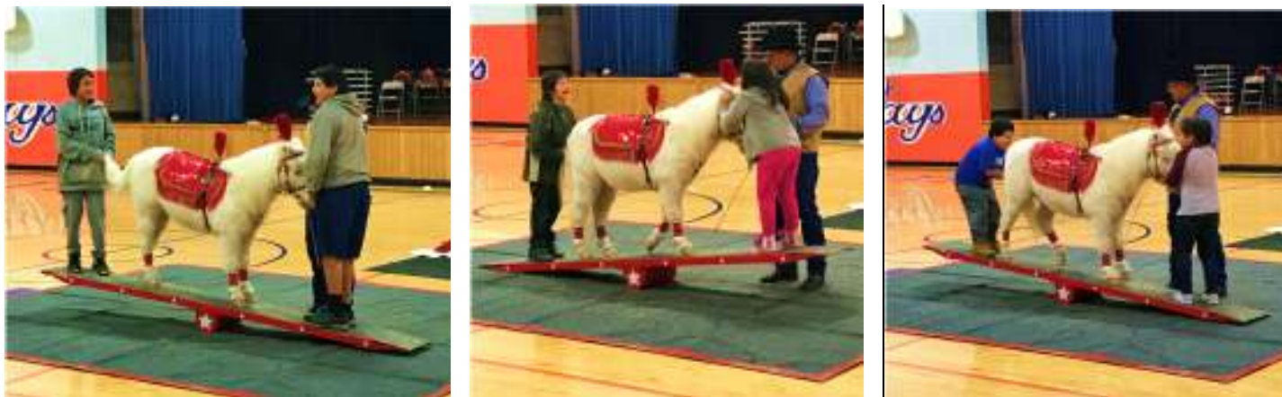
Students playing "Teeter Totter" with Houdini